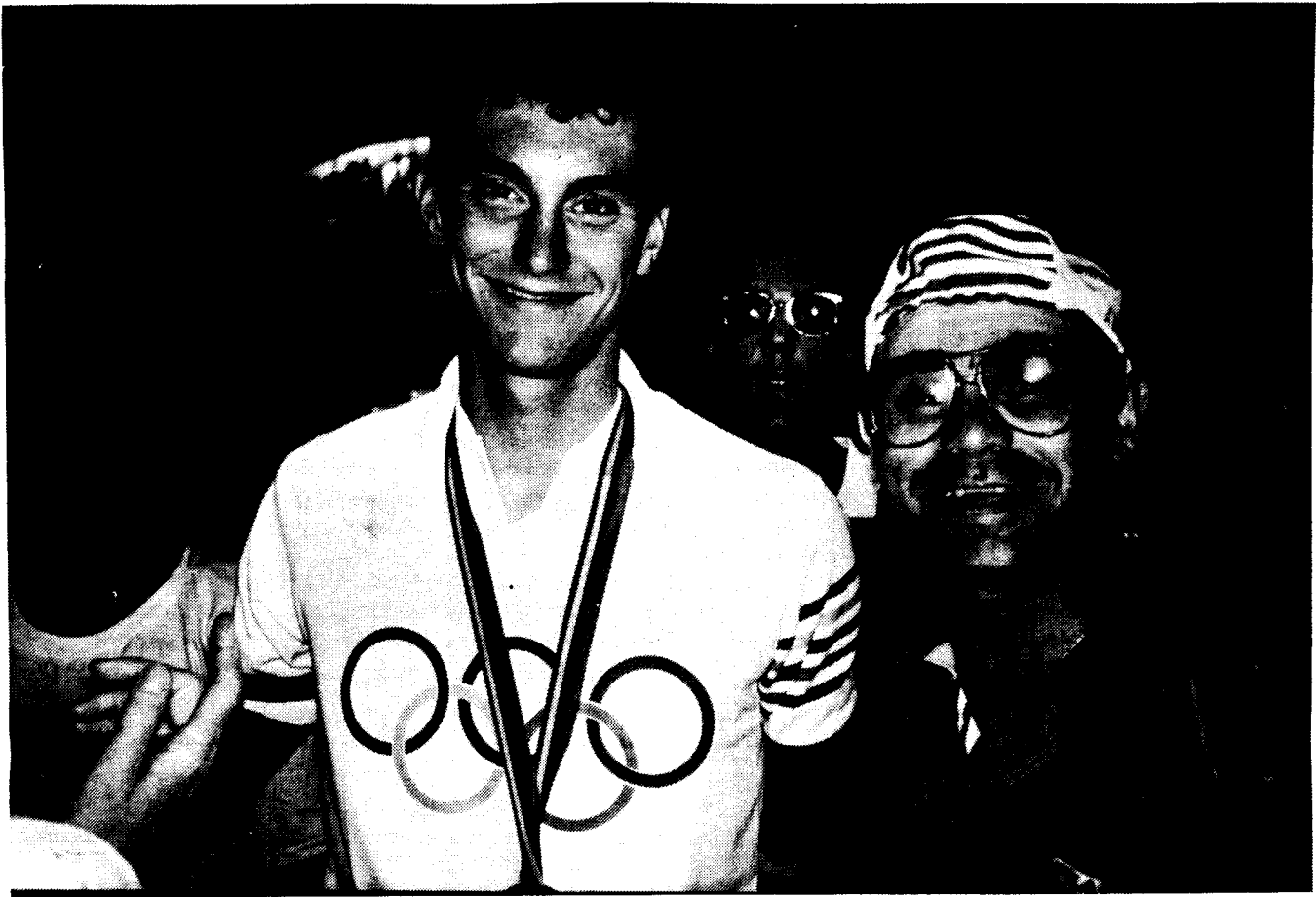
(L) Newly crowned Olympic men's road champion, Fabio Casartelli of Italy, with (R) unidentified Russian-born cyclist, photographed August 2 in Sant Sadurni, Spain, scene of the race.